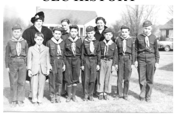
Pictured is one of our early Scout troops. We wish all our Scouts, leaders, and families a happy Boy Scout Sunday!